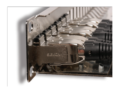
Panels feature integrated grounding via resilient ground tabs engaged during module insertion.