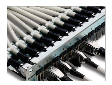
Integral rear cable manager facilitates the orderly routing of horizontal cables as well as maintaining proper bend radius for optimum performance.

Individual modules snap into place, providing integrated grounding without additional steps