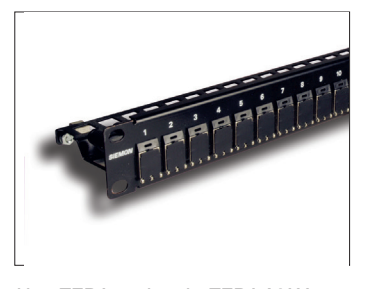
Use TERA outlets in TERA-MAX patch panel for telecommunications room applications.