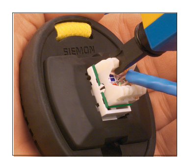
Termination Siemon's Palm Guard with MAX insert (p/n: PG-MX6) assists in securing outlet during termination.