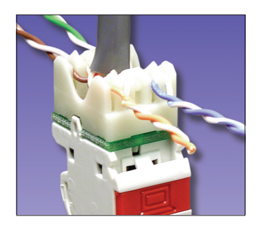
Quick Installation Pyramid wire entry system on S310 blocks separates paired conductors when lacing cables to simplify and reduce installation time.