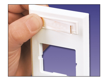
Faceplates Include quick pressure-release designation label covers for quick, tool-less removal

Cutouts Allow couplers to pass through plates enabling mounting of faceplates after cables are terminated