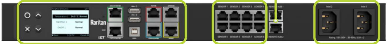
Model Shown: SRC-0800

Utilize these ports to connect two Remote Hubs, providing access to 8 additional sensor ports. Each hub and its connected sensors can be located up to 150 ft (50m) away from the device, expanding coverage to where you need it.