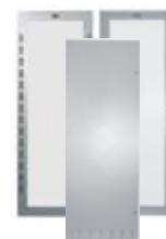
See Page 23 for door options