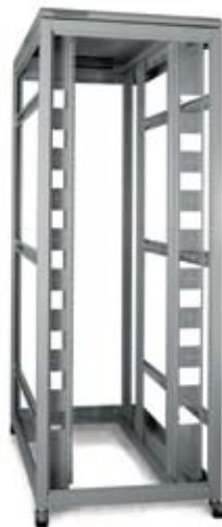
Bolted Steel Frame Chassis With High Load Capacity