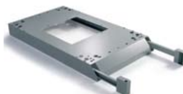
See Page 37 for full range of plinths