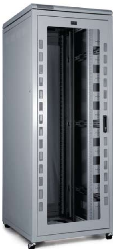
Model shown: CAB39810