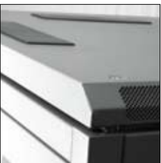
Multiple Roof Access Points

of this cabinet provides multiple cable entry positions and can also be partnered with cold aisle and overhead race way solutions.