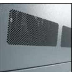
Additional Mesh Inserts To Assist In Heat Dispersion