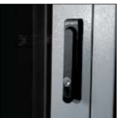
Lever Latch Locking Mechanism