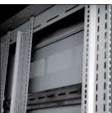
Vendor Neutral Adjustable Mounting Profiles