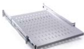
See Page 35 for the full range of compatible shelves