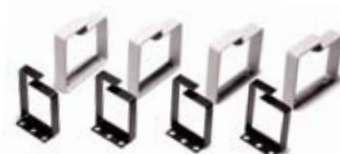
See Page 38 for the full range of cable management