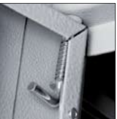
Quick Release Hinge System Provides Maximum Space During Installation