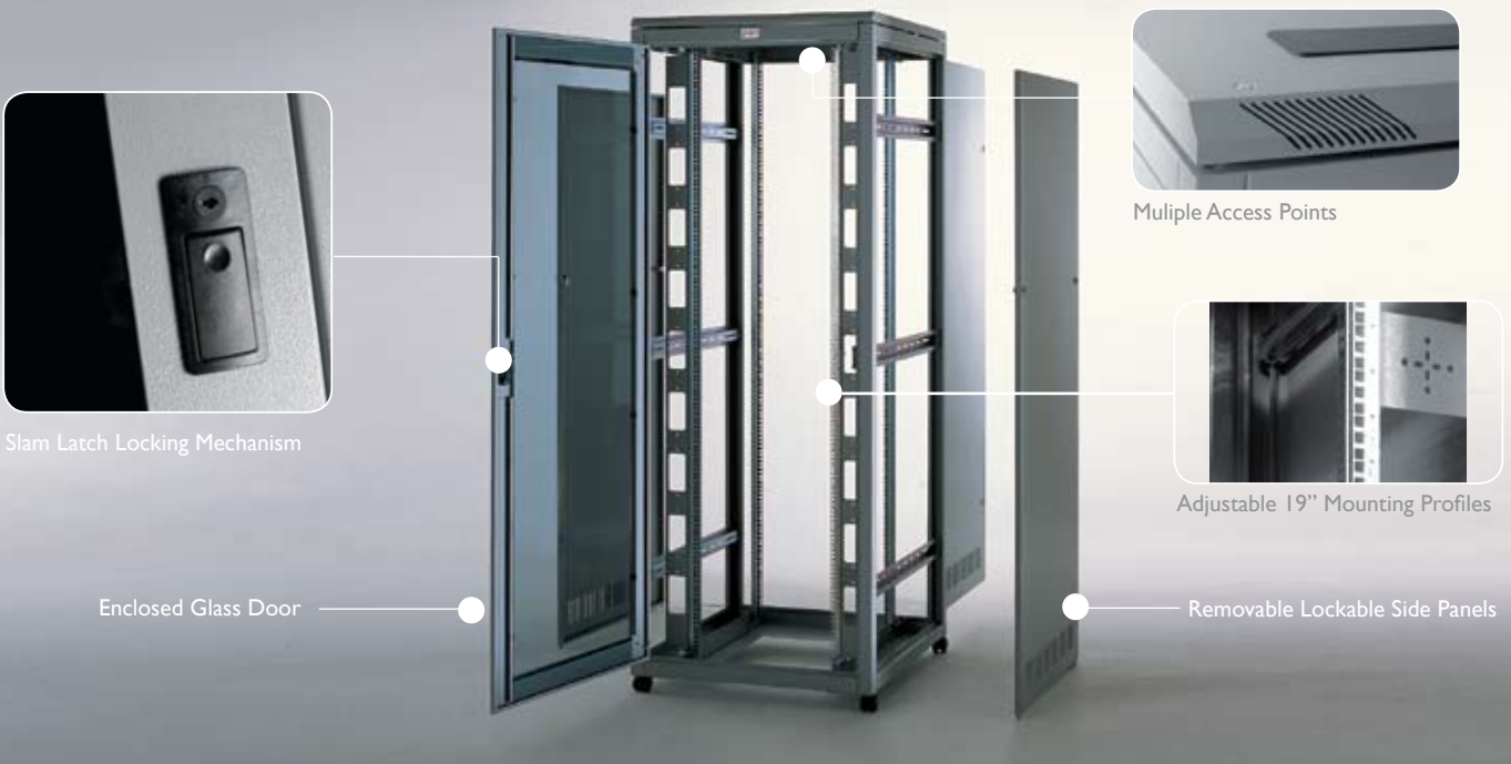
Slam Latch Locking Mechanism