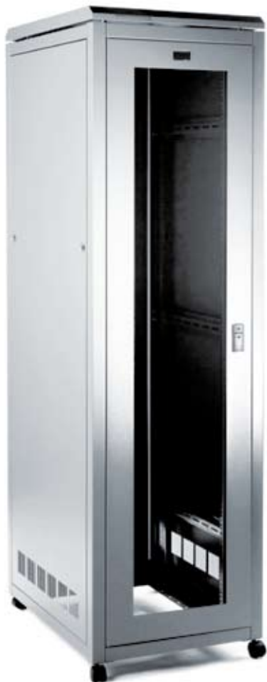
Model Shown: CAB3988