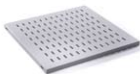
See Page 35 for the full range of compatible shelves