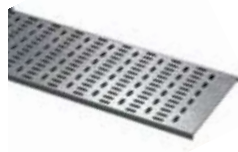
See Page 38 for the full range of cable management