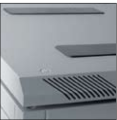
Multiple Cable Access Points Fitted

It's design has evolved from continuous development with today's installation teams.