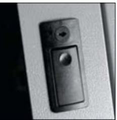
Slam Latch Locking Mechanism