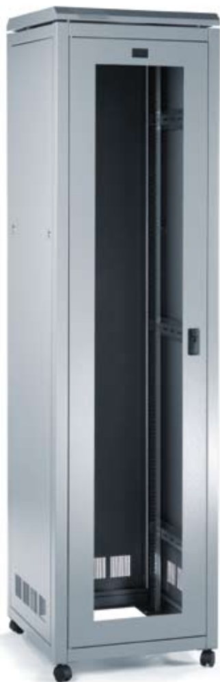
Model Shown: CAB4568