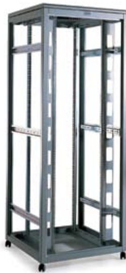
Bolted Steel Frame Chassis

A full range of door variants are available, see page 15