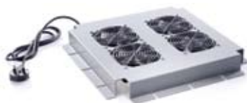
See Page 36 for the full range of compatible fan units