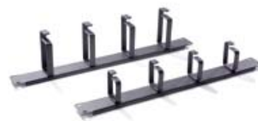
See Page 38 for the full range of cable management