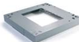
See Page 37 for the full range of available plinths