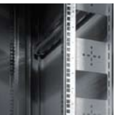
Vertical Cable Management On 800mm Wide Enclosures