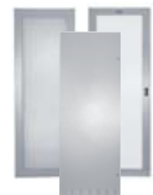
See Page 15 for door options