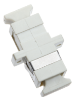
SC Multimode SIMPLEX ADAPTOR