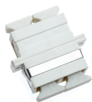
SC Multimode DUPLEX ADAPTOR