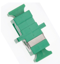
SC APC SIMPLEX ADAPTOR