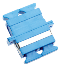
SC Singlemode DUPLEX ADAPTOR