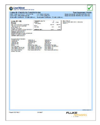
LinkWare Report with Encircled Flux and Test Reference Cords Tested